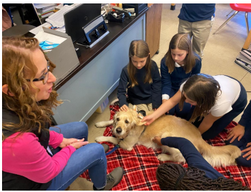
Last Friday, we had a special visit from MacKinley, the therapy puppy from Monadnock Therapy Pets!