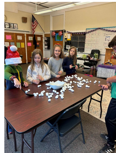
Right before the break, the elementary Religion classes and middle school Chorus had a blast during our version of winter Olympic Games and Minute to Win It...Hungry Hungry Hippo, Candy Cane Fishing, Snowball Shovel, and Nativity Bingo. Thanks to some very helpful middle school students who assisted with running the games!