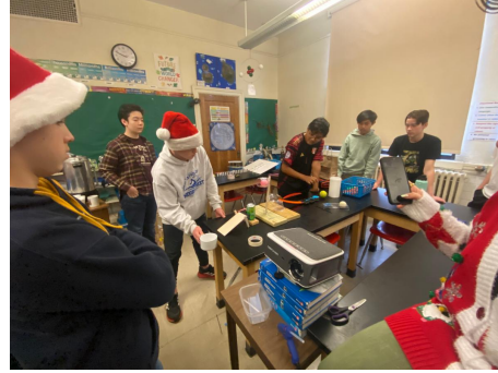
The 8th grade students demonstrated their Rube Goldberg projects in Science classes before the break!